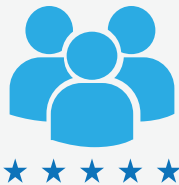
Enhanced Customer Experience