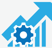
Enhanced Operational Efficiency